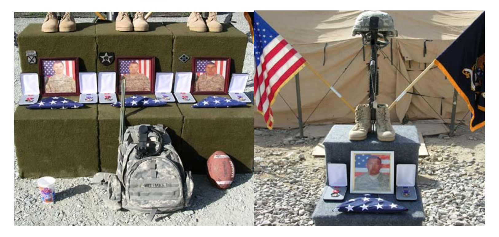
Memorial stands for our recently fallen heroes